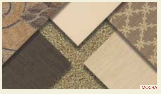
MAPLE • STANDARD FOR ALL DOLPHIN