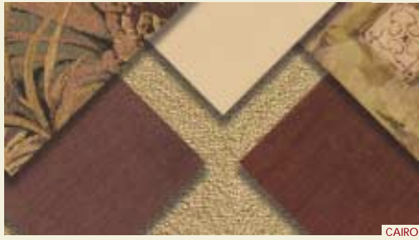
CHERRY • OPTIONAL FOR ALL DOLPHIN

NOTE: For Dolphin, all exterior graphics, interior decors and cabinetry woods are available independent of one another, and may be mixed to suit any taste. For Dolphin LX, either the Sterling or Heritage Edition packages determines the interior decor, exterior color and optional cabinetry woods, which can not be mixed between packages.