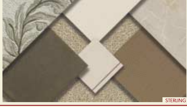
MAPLE WALNUT STD FOR STERLING OPT FOR STERLING

NATIONAL R.V., INC. 3411 N. Perris Boulevard Perris, California 92571 (800) 260-8527 · Fax (909) 943-8498