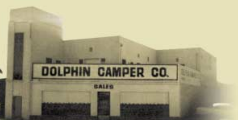
SAN EEDNANDO, CA HOME OF DOLDHIN CAMPED COMPANY DEDECESSOR TO NATIONAL BY A 1046